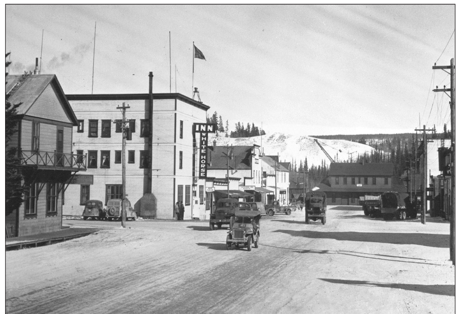
WHITEHORSE DURING THE 1940'S - The Bank of Commerce is to the immediate left. The three story white building is the Whitehorse Inn. The White Pass train depot is at the end of the street, with the Whitehorse Theatre to the immediate right.

By Horace E. Moore Star Editor 1937 - 1950